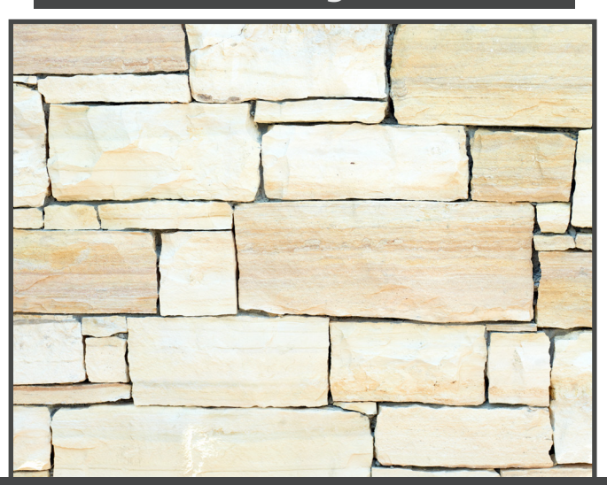
Office - 2276 South Daniels Road. Heber City, Utah 84032