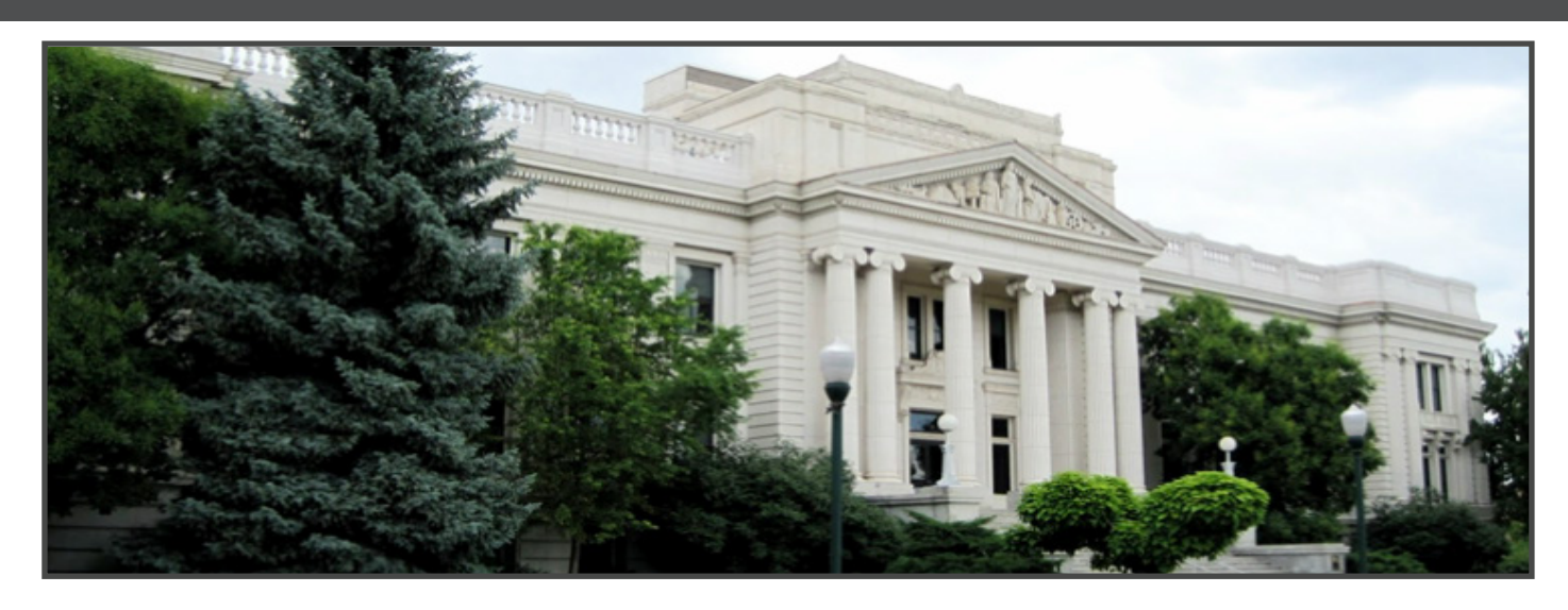
New Utah White Limestone available now through Mountain Valley Stone and Delta Stone

In keeping with our commitment to provide the highest quality domestic stone, we are excited to offer Utah limestone. This lovely stone has tawny shades of alabaster, ivory, pearl, and is often accented by stripes of sun-burned sienna. Used on historic buildings throughout the country, this stone brings a regal elegance to any masonry project.